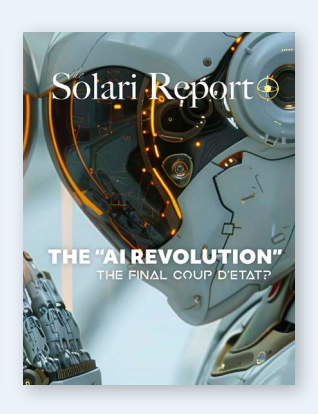
Gold & Silver

Defending Family Wealth and Sovereignty for 5,000 Years